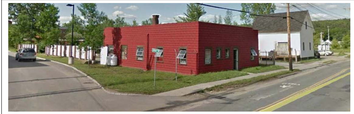
122 & 124 Water Street Parcels

motor vehicles in which any vehicle is kept with gasoline in its tank shall be classed as a "business garage," and also any building in which motor vehicles are kept in dead storage for profit. Whereas "Repair Garage" means a building or structure or part thereof or any premises used for making major changes and adjustments to motor vehicles including structural changes or repairs, and including work involving the use of machinery.